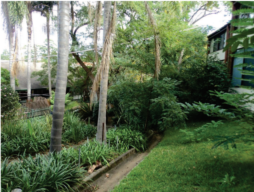
Photograph 3.2 Planted exotic vegetation within mulched garden beds typical in areas mapped as Urban Exotic/Native Vegetation

Asparagus aethiopicus is classified as a Class 4 noxious weed and Oxalis corniculata is classified as a Class 5 noxious weed within the Parramatta City Council control area.