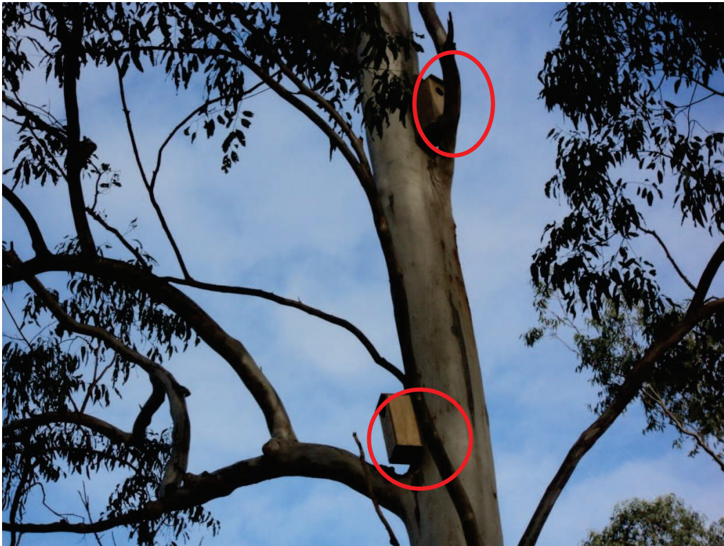
Photograph 3.4 Eucalyptus saligna with two nest boxes (circled in red)