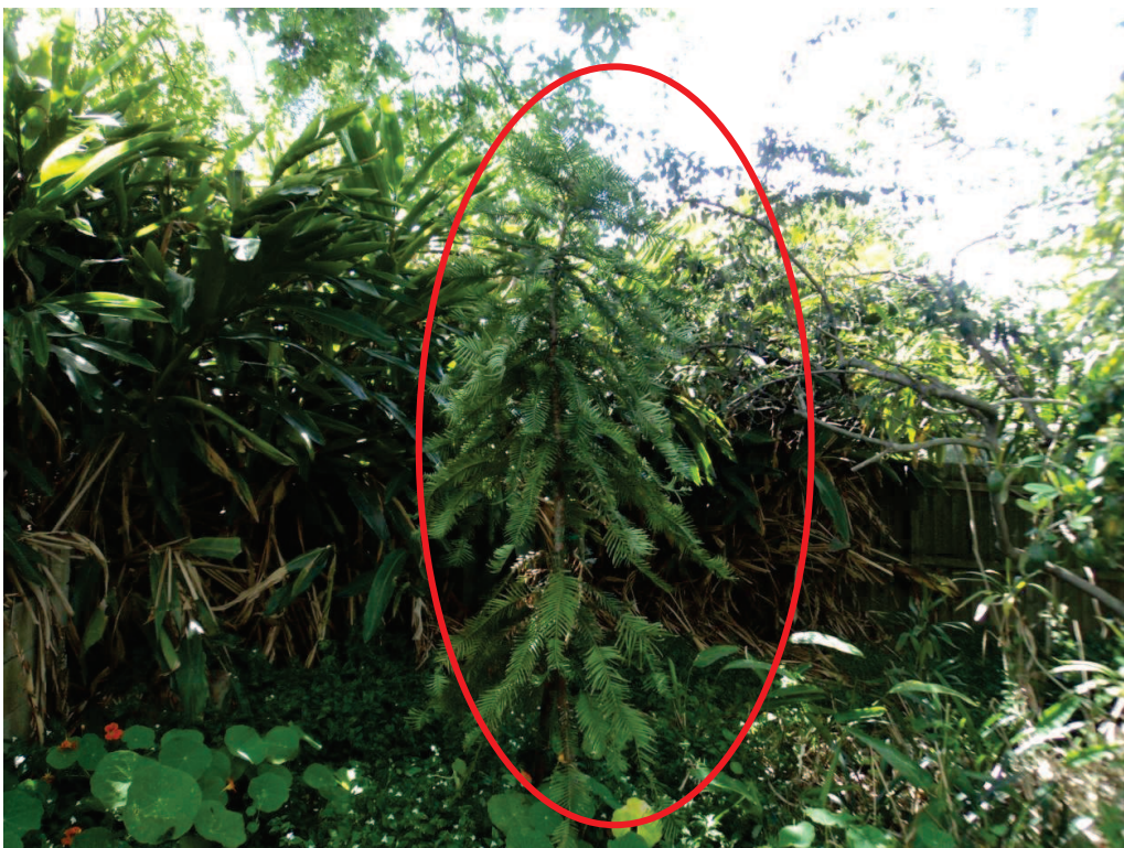
Photograph 3.3 Planted Wollemia debilis (circled in red) present within 8 Tintern Avenue

No other threatened flora species have been recorded within the study area. An analysis of the likelihood of occurrence within the study area for each threatened flora species recorded within the locality is provided in Appendix B . This assessment concluded that none of threatened flora species known from the locality are likely to occur within the study area.