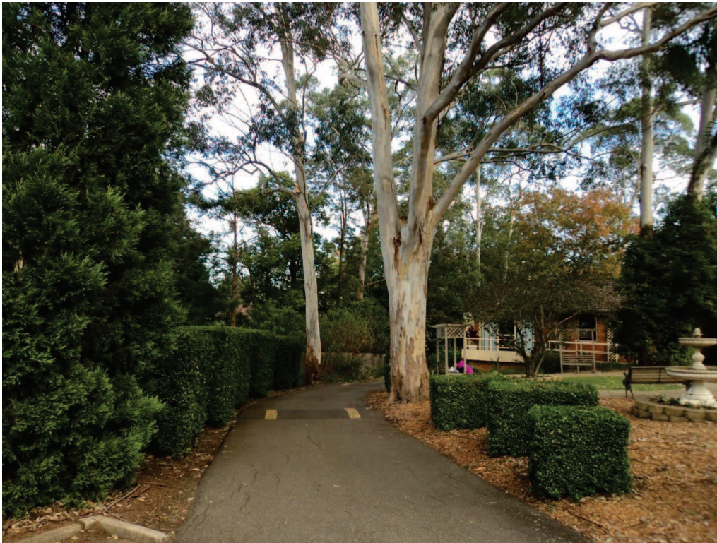
Photograph 3.1 Mature Eucalyptus saligna trees (Blue Gum High Forest) within Area 1