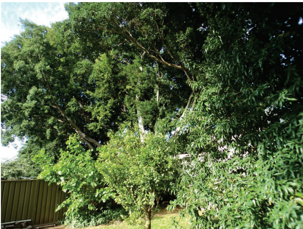
Photograph 3.5 Ficus microcarpa hillii with potential tree hollows